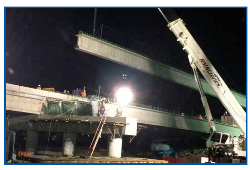
Crews set girders for the bridge as part of work in Phase 3.

In addition, there will be construction on the Cherry Creek Trail. The trail will extend under Arapahoe Road, giving pedestrians and cyclists improved connectivity throughout the trail system.